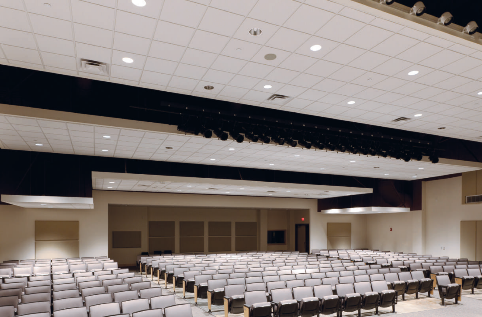
Fine Fissured Reveal (White) (HHF-154)