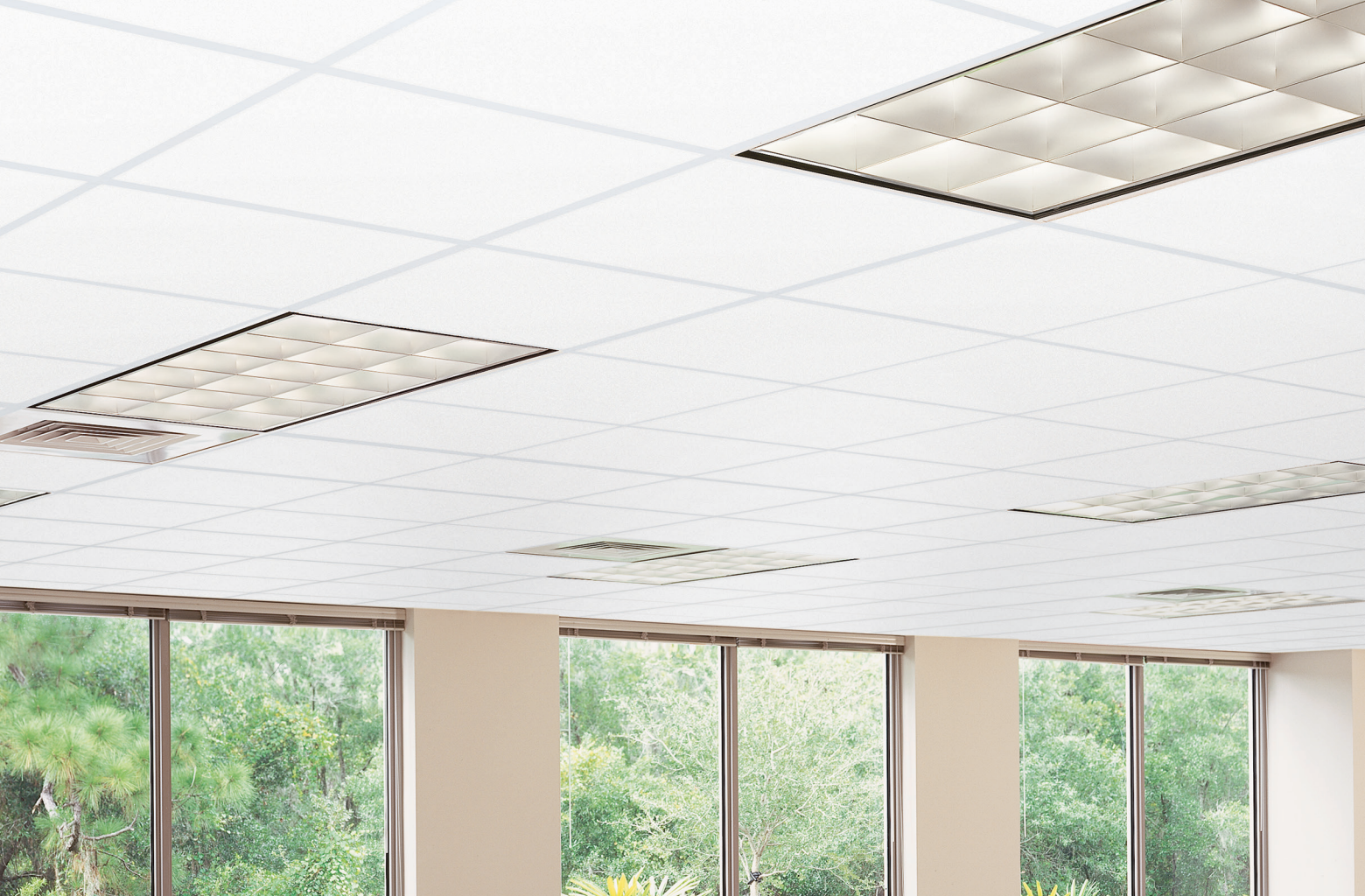
VinylShield™ A Trim (1102-CRF-1)