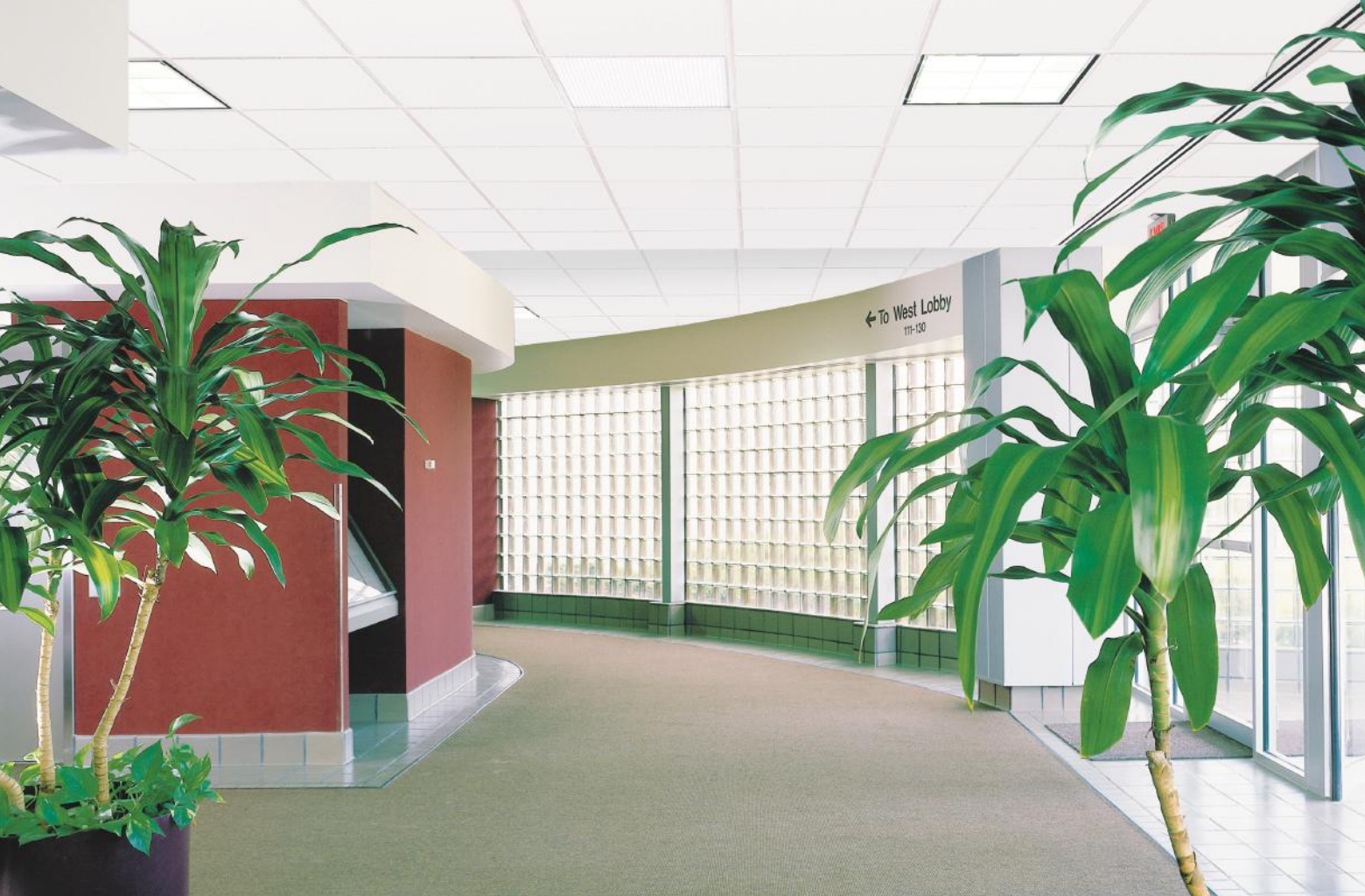
Sand Micro™ Reveal (SHM-154)