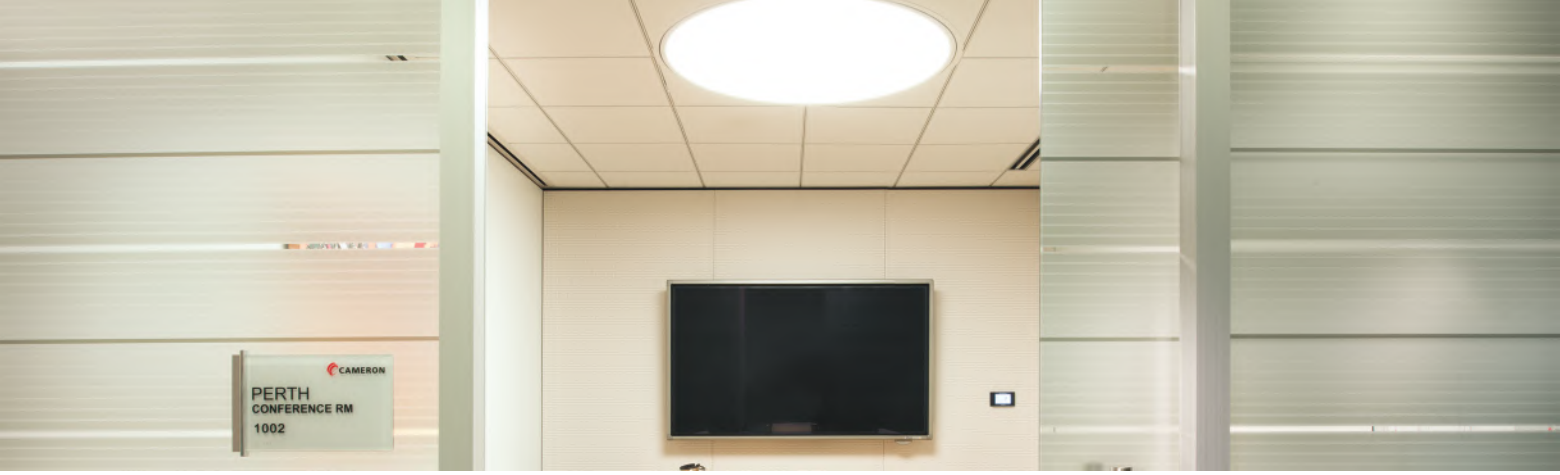
Symphony® m Narrow Reveal (1222BF-IOF-1)