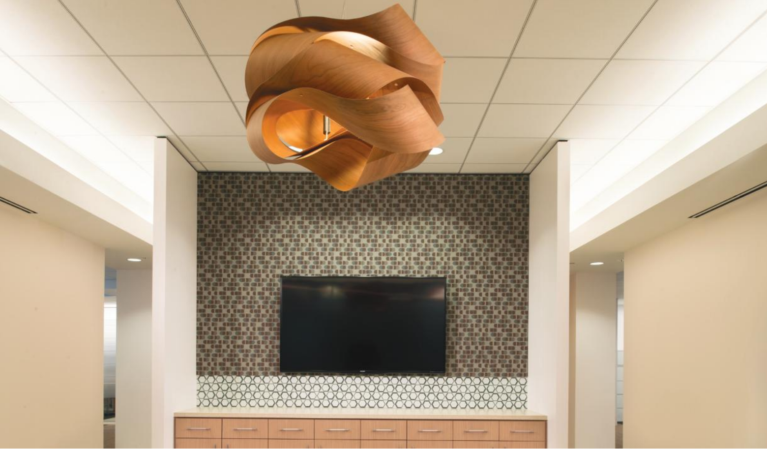
Symphony® m Narrow Reveal (1222BF)